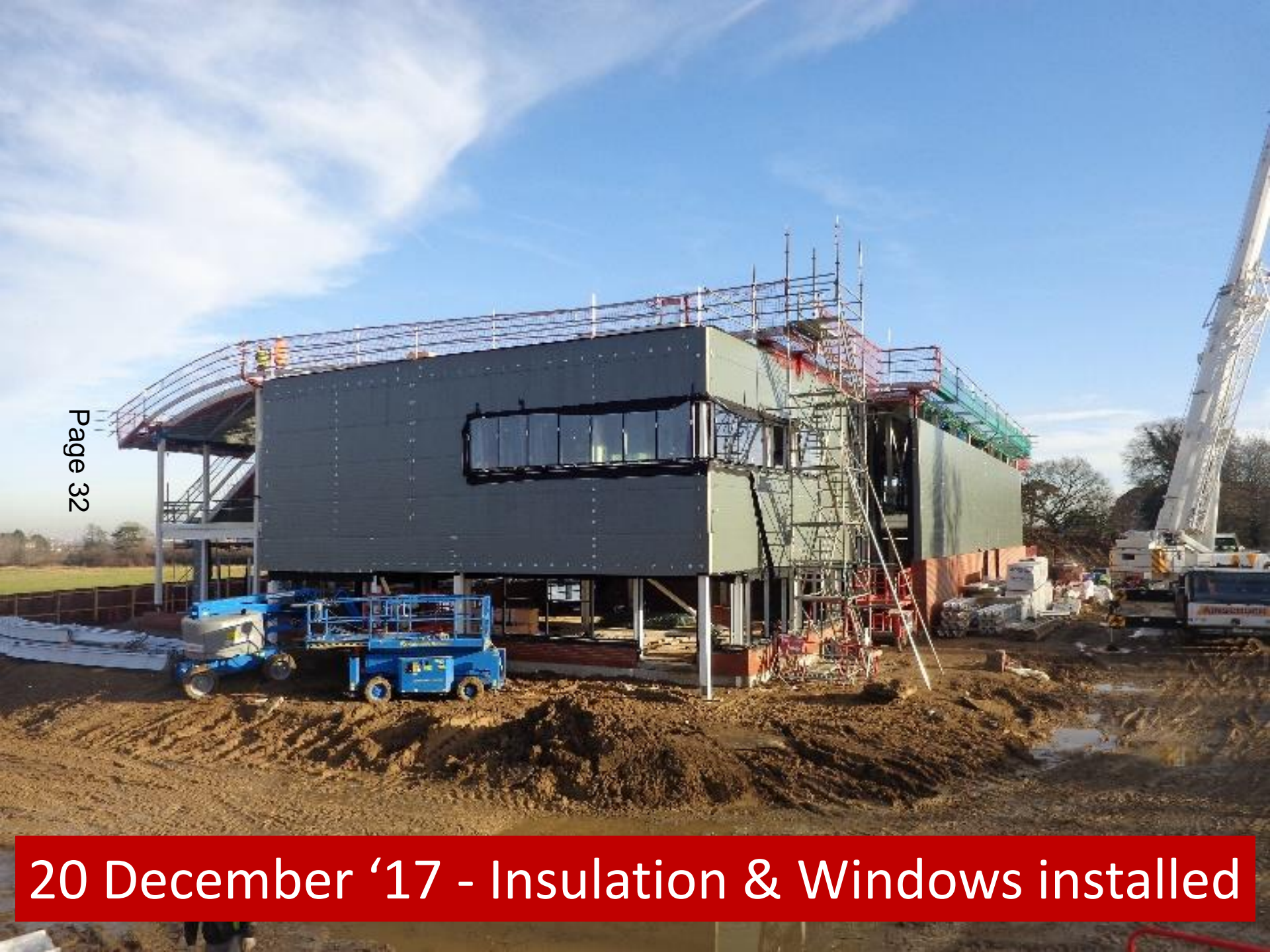
20 December '17 - Insulation & Windows installed