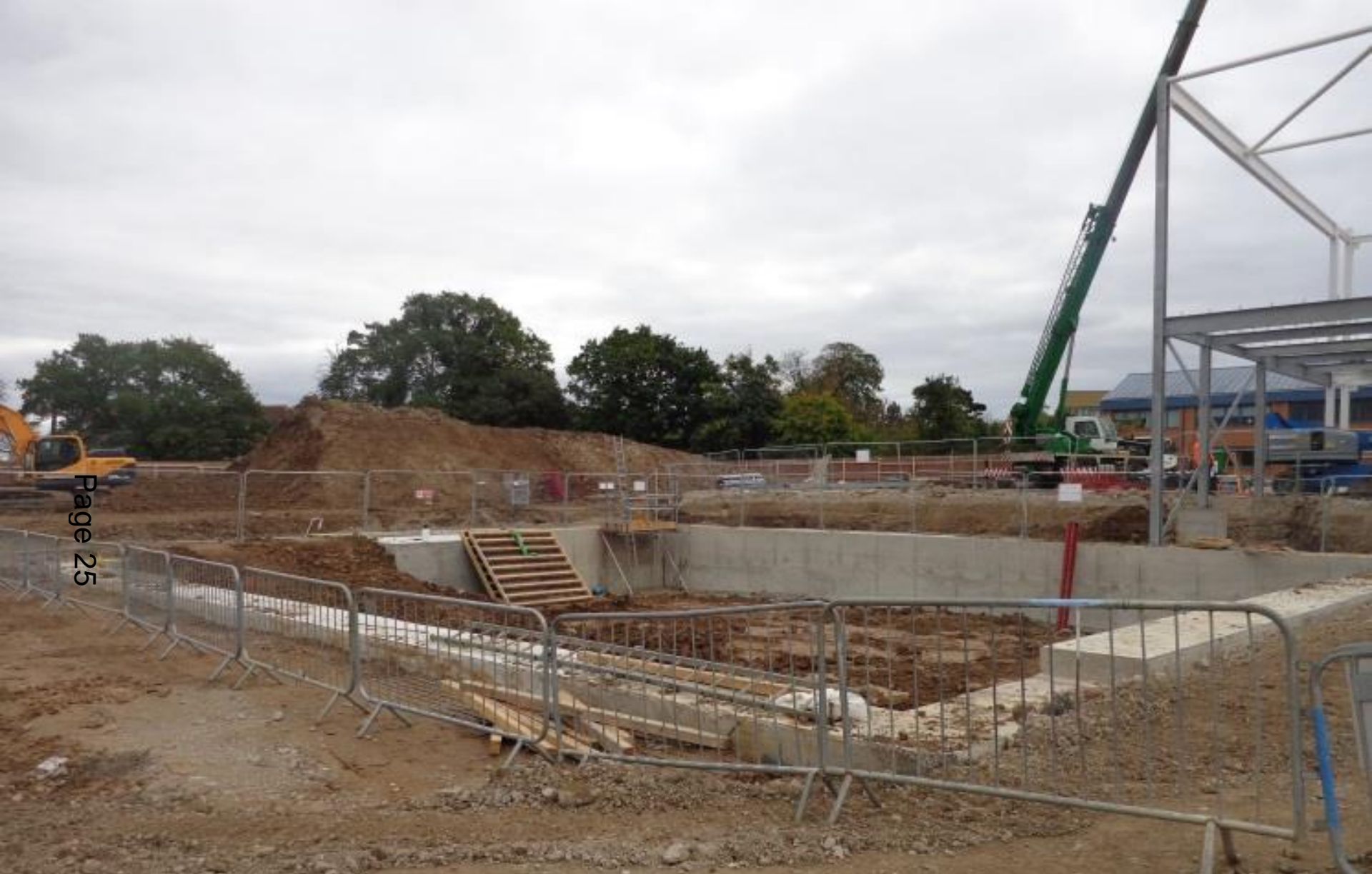
11 October '17 – Secondary pool under construction