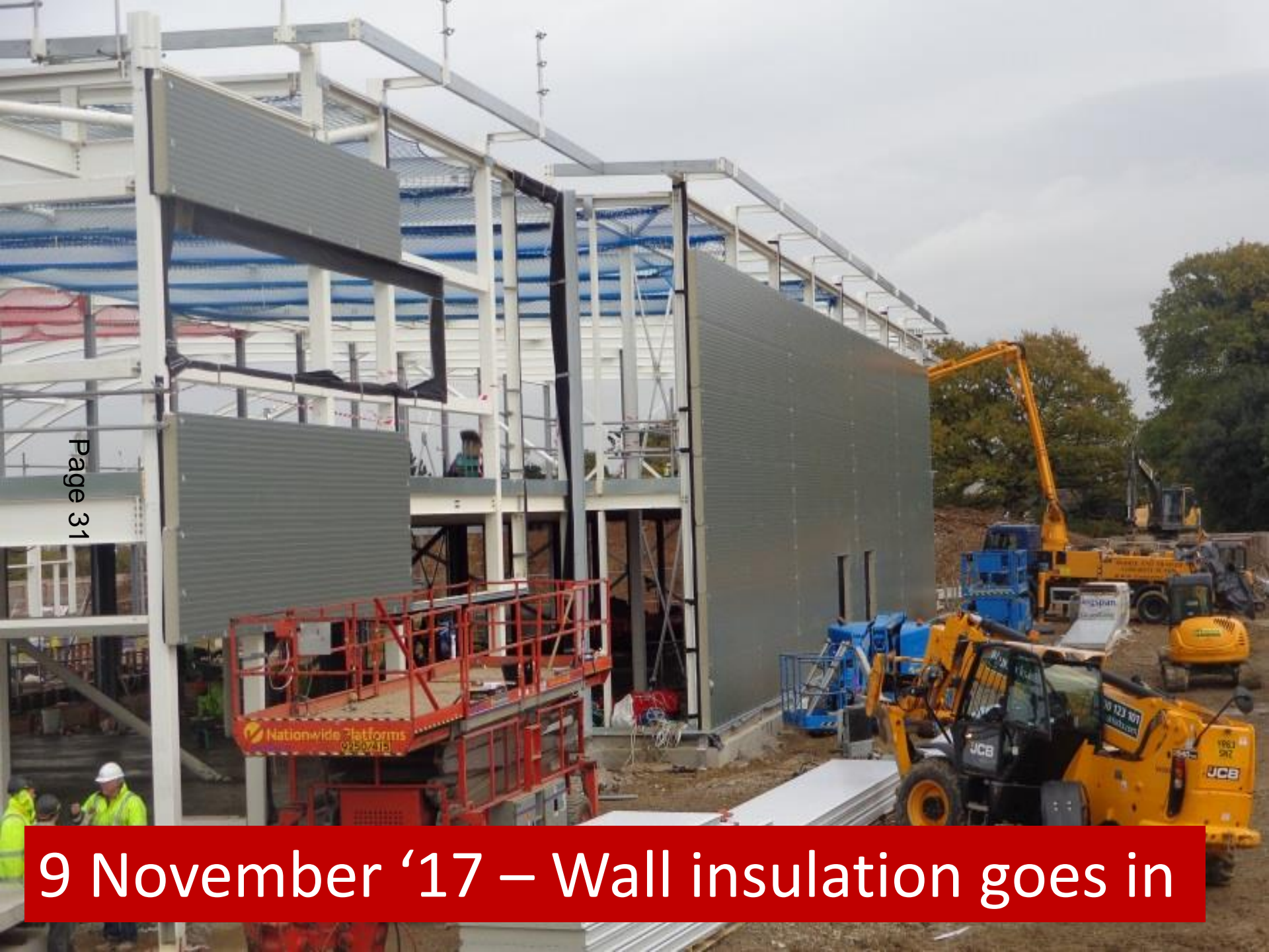
9 November '17 – Wall insulation goes in