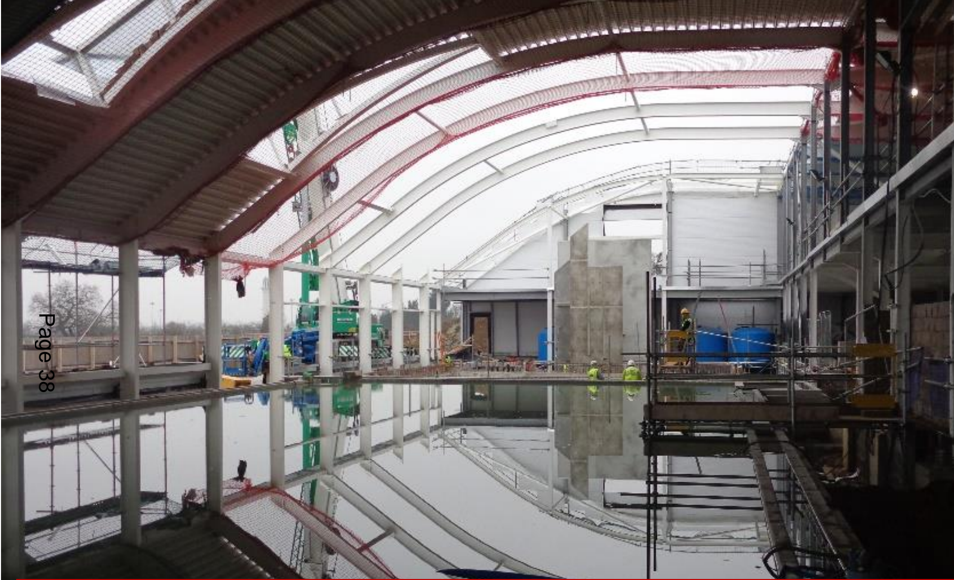
24 January '18 - View from Café – Reflection of roof in water; diving tower in secondary pool