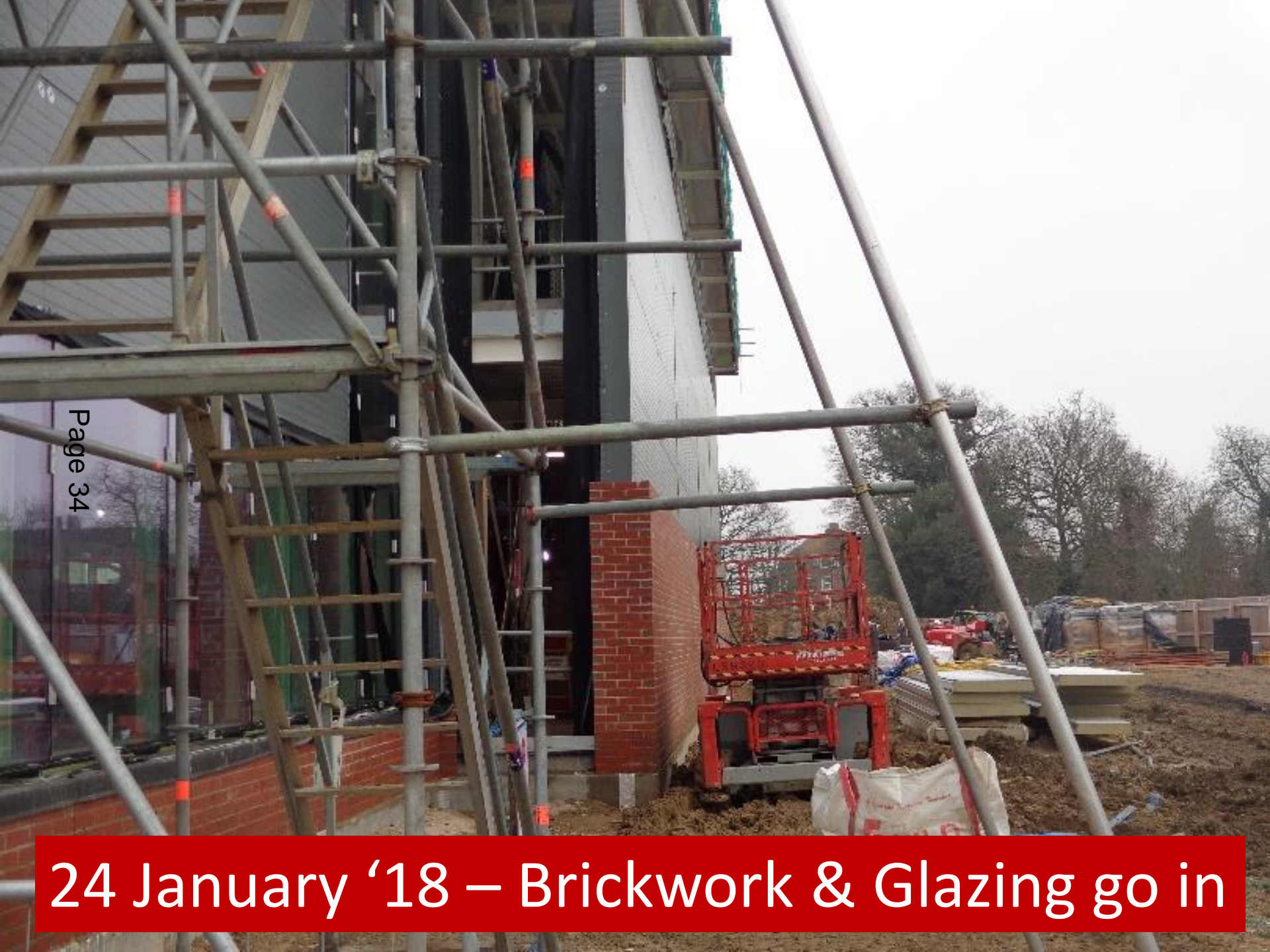
24 January '18 – Brickwork & Glazing go in